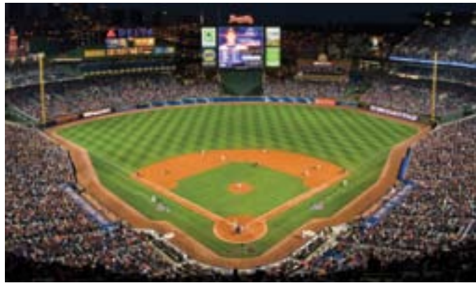
SPORTS MECCA: Say what you want about the Thrashers leaving, but Atlanta is still a first-class sports town. Unlike other publications, we look at more than just pro leagues to judge the best cities for sports. Atlanta’s unique combination of quality athletics from high school to college to the pros should put it at the top of any sports town rankings.

Conway can be reached at sconway@scoreatl.com .